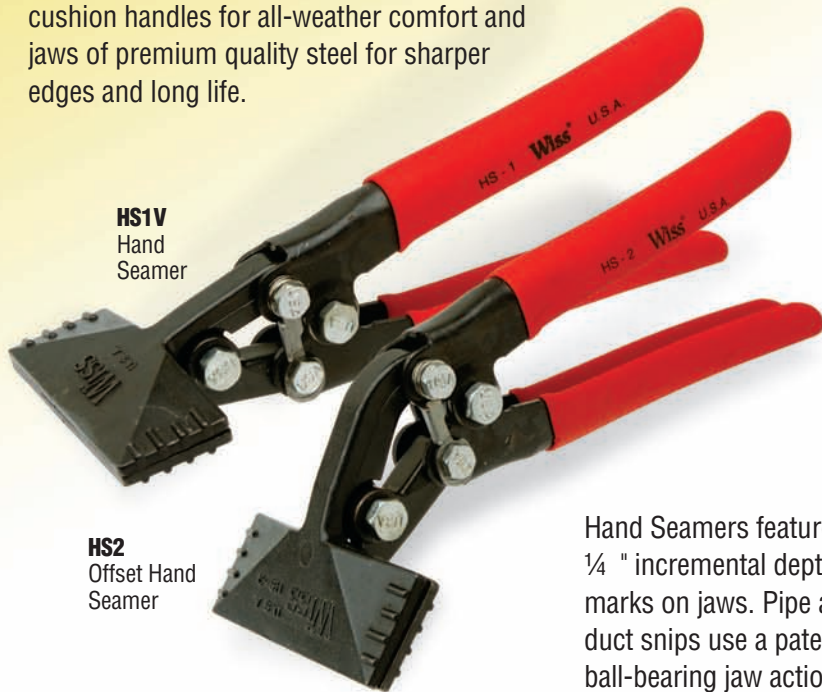
HS1V Hand Seamer

Wiss HVAC tools feature rust resistant blades and compound action jaws for easy metal bending, cutting, and flattening. All have cushion handles for all-weather comfort and jaws of premium quality steel for sharper edges and long life.