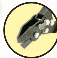
HN1V Hand Notcher

Join corrugated round or square sheet metal pipes of same size with ease. Crimpers work on up to 22 gauge sheet metal. Notcher produces a clean 30° V-shaped cut in sheet metal without slippage.