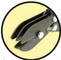
HC5V Five Blade Hand Crimper