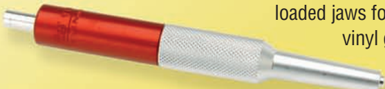
WTNP1 Trim Nail Punch

The offset blade on the Siding Removal Tool keeps hands and knuckles clear when pulling damaged vinyl siding, while the Trim Nail Punch assures proper nail setting depth without denting the surfaces of soffit, fascia and trim. Also, the Trim Nail Punch accommodates up to 1/4" standard trim and features a long nose for easy access to 1/2" J-Channel. The Snap Lock Punch Tool incorporates spring-loaded jaws for added speed and vinyl grips for increased comfort.