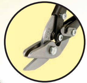
M41R 9 1/4" Metalmaster Pipe & Duct Snips

Hand Seamers feature 1/4" incremental depth marks on jaws. Pipe and duct snips use a patented ball-bearing jaw action that automatically adjusts blade clearance. Choose the HM41V for rigid non-metallic sheet materials or the M41R for sheet metal, vinyl tiles and plastic laminates.