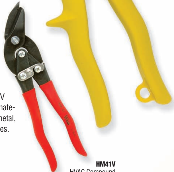
HM41V HVAC Compound Action Pipe & Duct Snips