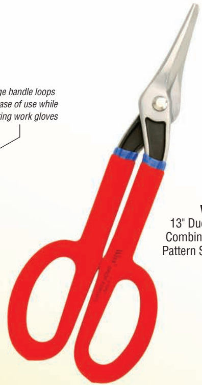
V19N 13" Duckbill Combination Pattern Snips