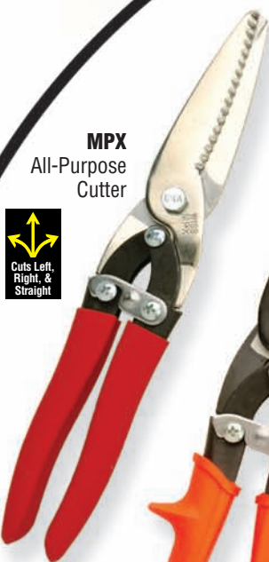
MPX All-Purpose Cutter

The MPX All-purpose Cutter has 3-inch chrome-plated blades to resist rust and corrosion, with grips designed for smaller hands. The M300 MultiMaster® snips combine the long cut of traditional tinner's snips with the power of compound action, making them perfect for long, fast cuts in materials like paper, plastic, and sheet metal. MPC3 Metal Wizz® snips are made for around-the-home use, cutting materials like screening, shingles, carpeting, and many more with ease.