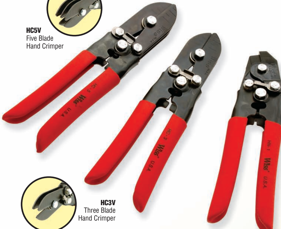
HC3V Three Blade Hand Crimper