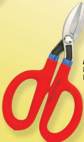
A12N 8 1/4" Straight Pattern Snips