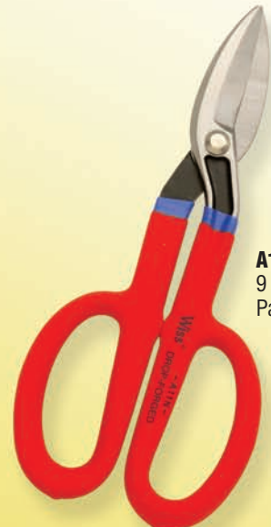
A11N 9 3/4" Straight Pattern Snips