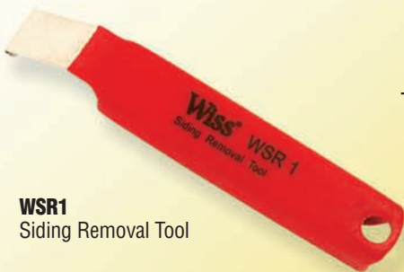
WSR1 Siding Removal Tool