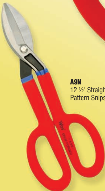
A9N 12 1/2" Straight Pattern Snips